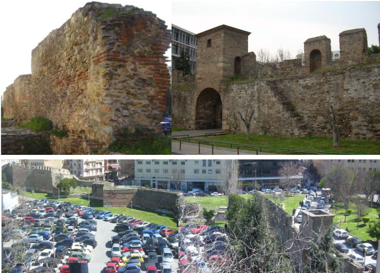
Figure 1: Aspects of the Wall complex under study